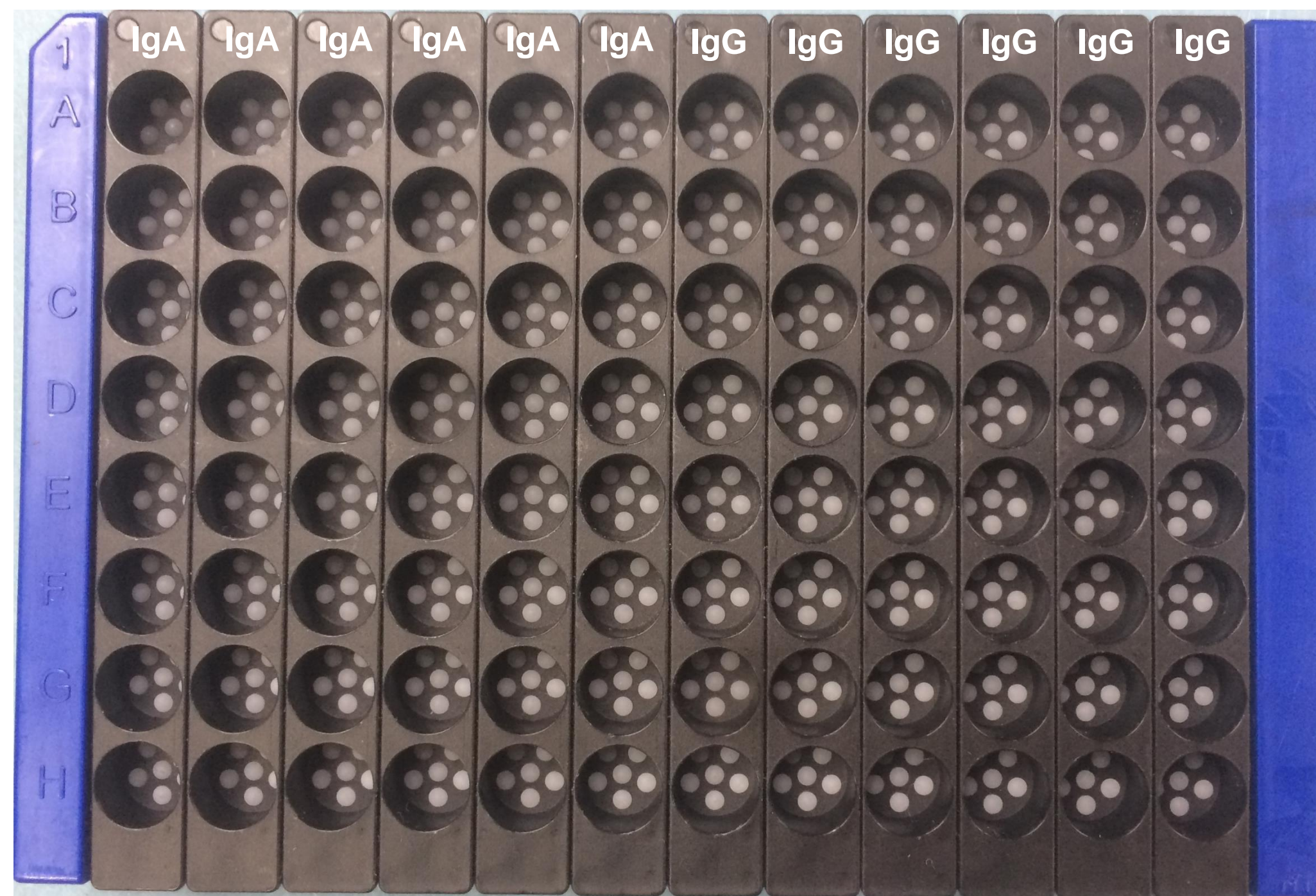
Figure 1a. Celiac SmartPLEX assay plate with combined IgA and IgG SmartPLEX test strips

The IgA assay uniquely incorporates a bead that detects total serum IgA. Approximately 1:400 celiac patients is IgA deficient; a negative IgA tTG or dGP result could be a consequence of this deficiency rather than the absence of specific IgA antibodies. IgA concentrations <0.07 mg/mL are indicative of IgA deficiency.