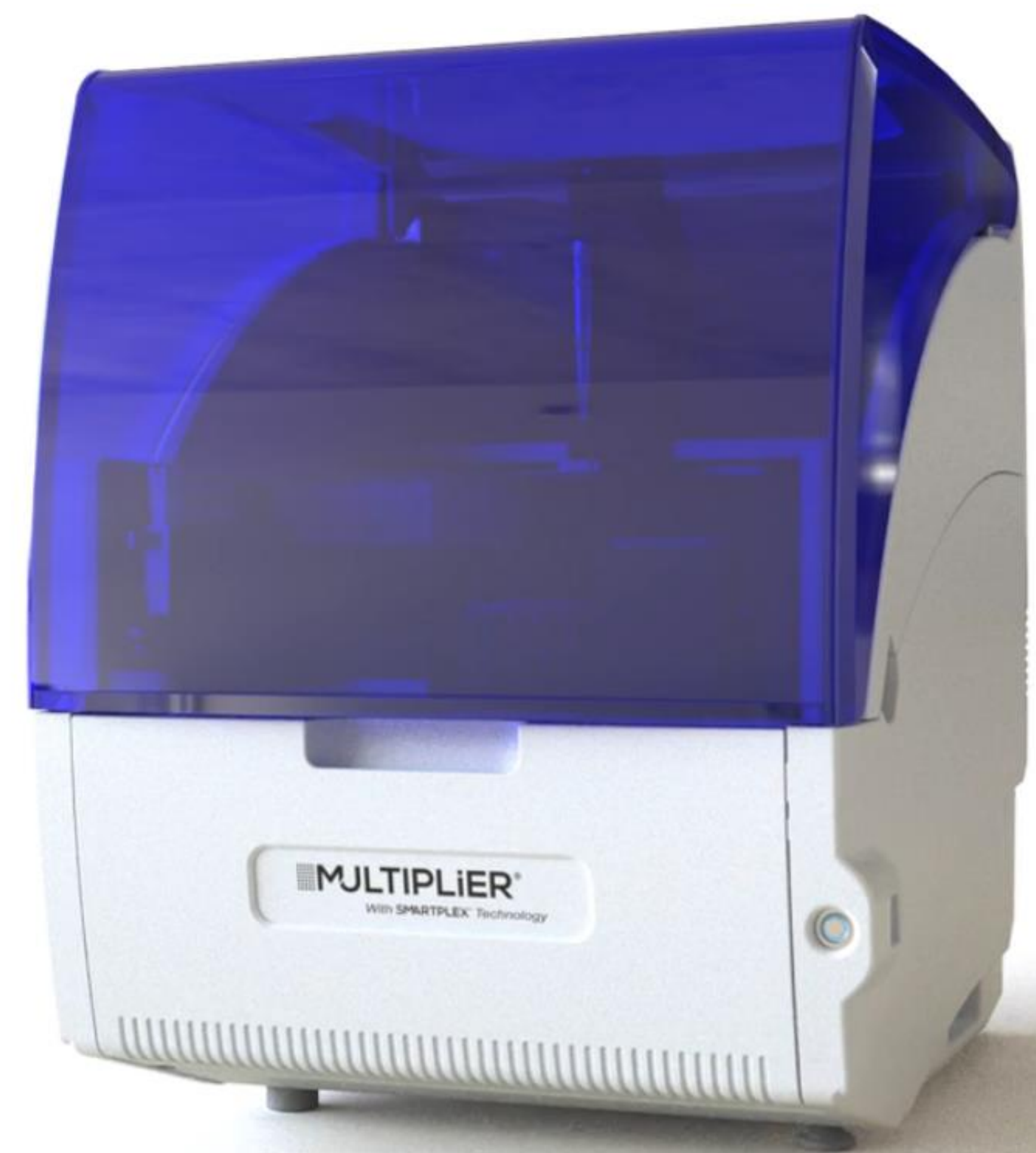
Figure 1d. Multiplier instrument