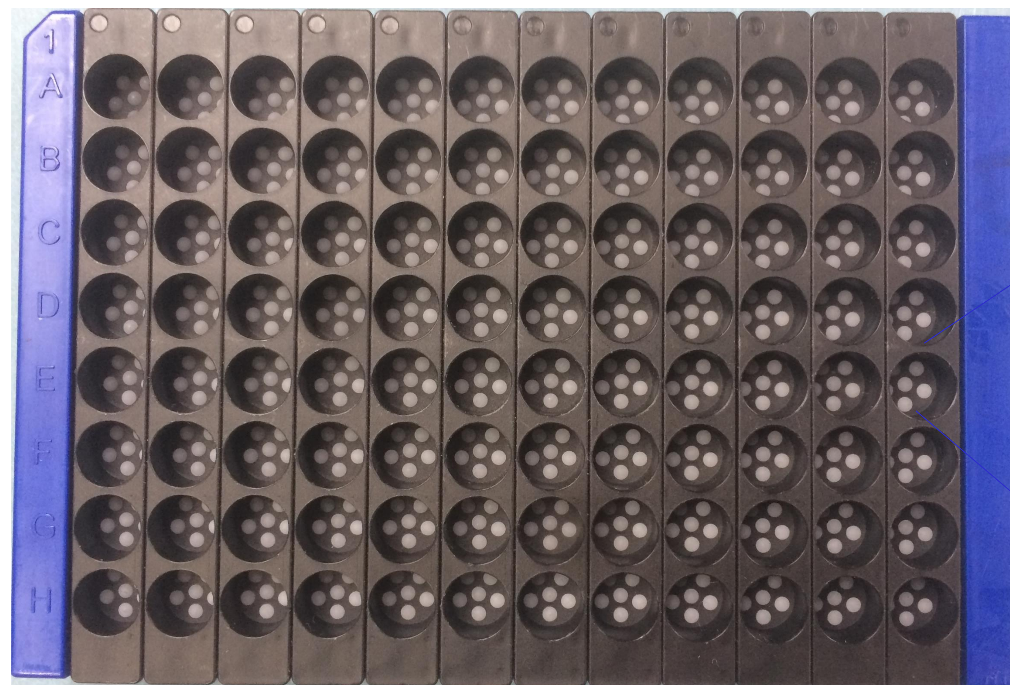
Figure 1a. Beaded assay plate

The results are summarised in the figures below. Precision (Figure 2) and concordance (Figure 3) were found to be comparable to commercially available MMRV ELISA's. ROC analysis gave the following area under the curve results: Measles 0.995, Mumps 0.987, Rubella 0.998 and VZV 0.999.