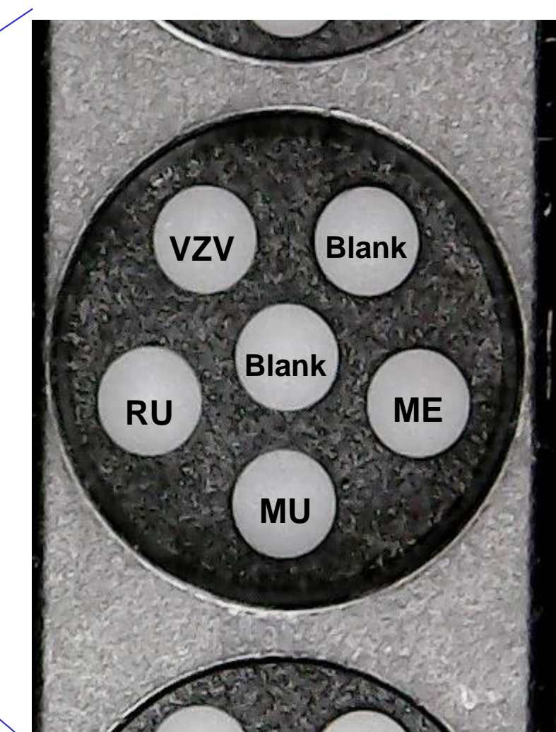
Figure 1b. Magnified well